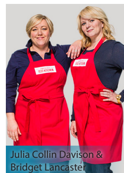
Julia Collin Davison & Bridget Lancaster